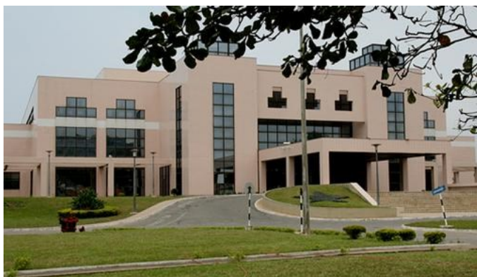
The venue — Accra International Conference Centre